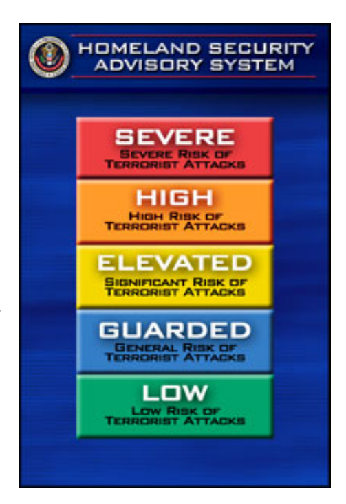
Cultural innovation, Bush style.

the Administration faces doubts about the effectiveness of a generalized 'war' against terrorism. As the epicenter of evil drifts from one strategic oil reserve to the next, anxiety over the unclear scope of U.S. retaliation grows. Caught in a contradiction, the Administration claims to be making progress, but stresses that the danger of terrorist attack remains high. Improvising, it develops awkward new narrative devices to maintain the desired state of suspense and fear. The Office of Homeland Security introduces the color-coded national threat level meter, a fearful scale that serves like a sustained crescendo in a soundtrack, foreshadowing exciting events to come. Intentional "leaks" of threatening news, oddly timed announcements of break-through arrests, civilian tip lines -- as these sub-plots multiply, the waves of alarm feel more like melodrama than action or adventure. As anger subsides and the war expands, the Administration's plot becomes increasingly cumbersome and implausible. Demanding a satisfying resolution, the public ardently resists the notion that America can rid the world of terrorists by policing the globe with high tech weaponry. Ultimately, the war on terrorism is abandoned because awareness spreads that it generates new enemies and assures the continuation of a hideous military-industrial plutocracy.